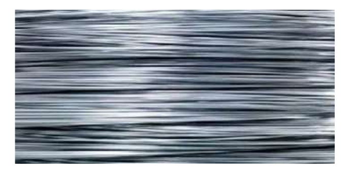
Starting material wire spool